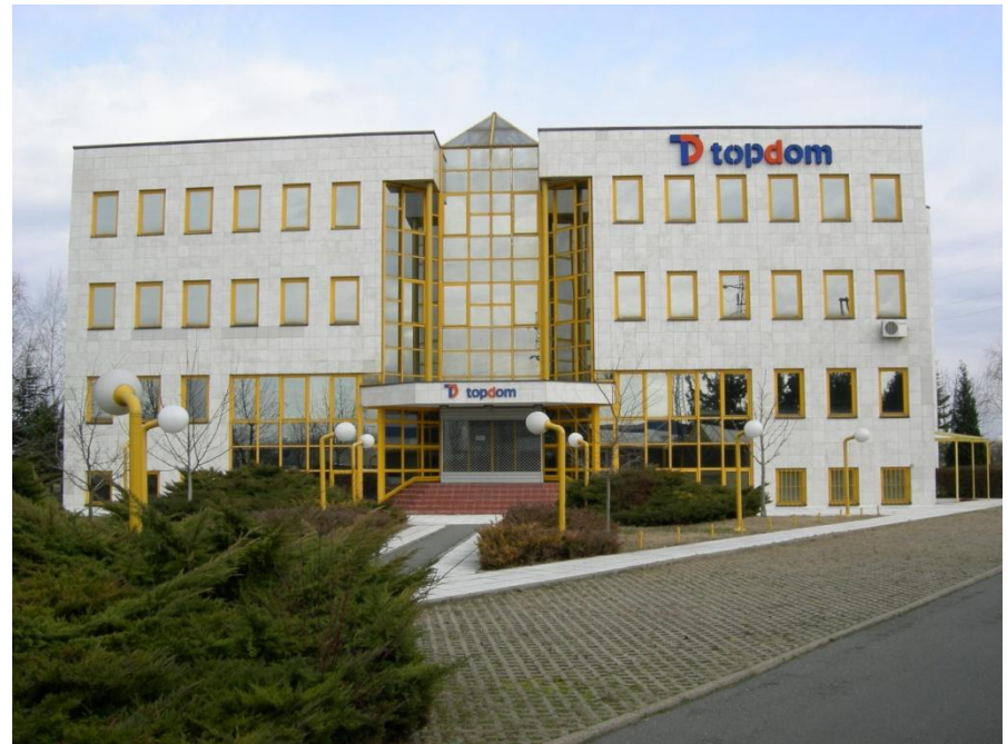
Topdom d.o.o. Novi Sad