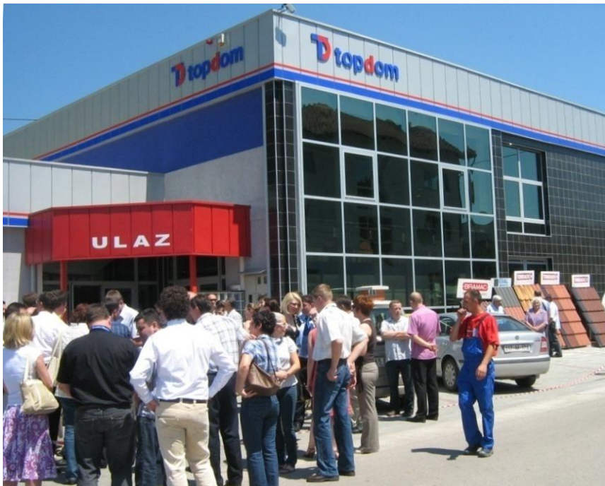
Opening of Trgovina Topdom d.o.o.Tuzla (Bosnia and Hercegovina), June 2009